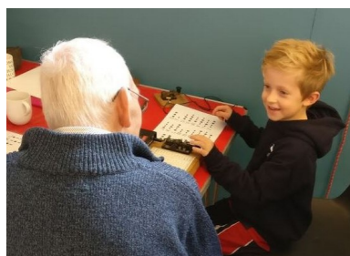
GB2SHS - Morse