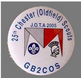
GB2COS - 2005 badge