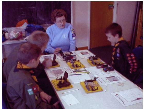
GB00PZ - Morse code - always popular