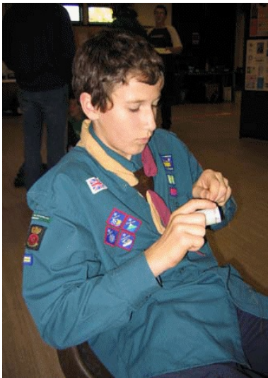
GB2ODS - Winding coils for the crystal radio. So relaxing!