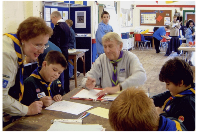
GB4MHD - Cubs decoding ciphers